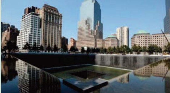
The World Trade Center Memorial Fountain

The largest manmade waterfall in North America is waterproofed with CIM. When it came time to select the toughest waterproofing system for the World Trade Center Memorial Fountains, the design consultants chose CIM. No other waterproofing could meet the performance requirements of the extreme environment present at New York City's largest construction site.